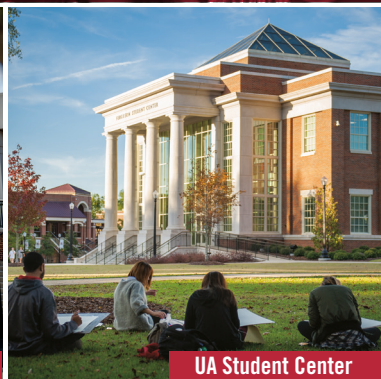
UA Student Center