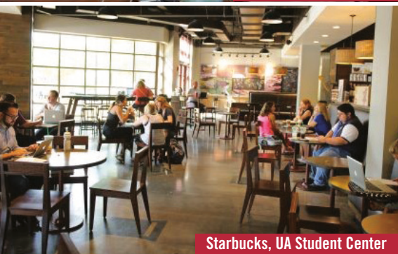
Starbucks, UA Student Center