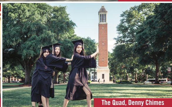
The Quad, Denny Chimes