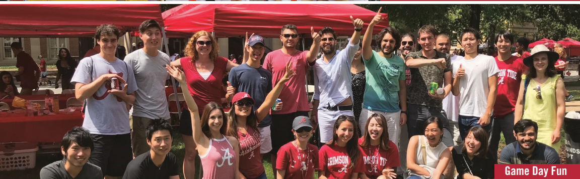
Game Day Fun