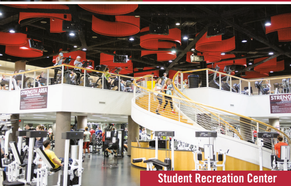
Student Recreation Center