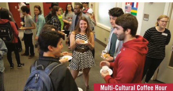
Multi-Cultural Coffee Hour