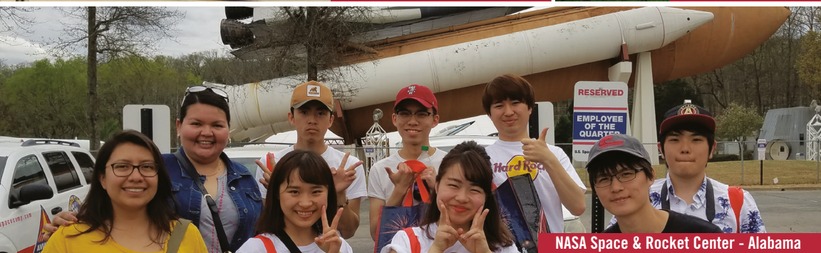
NASA Space & Rocket Center - Alabama