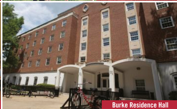
Burke Residence Hall