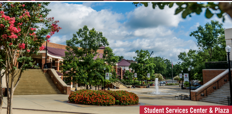
Student Services Center & Plaza