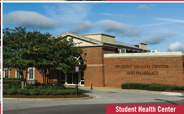
Student Health Center