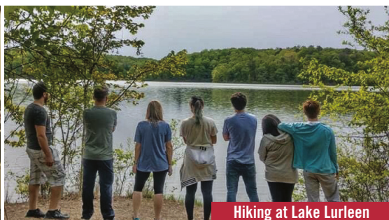
Hiking at Lake Lurleen