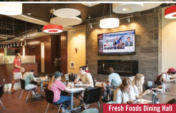
Fresh Foods Dining Hall