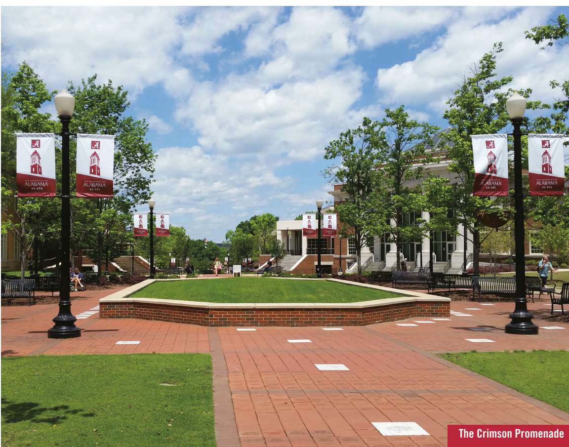
The Crimson Promenade