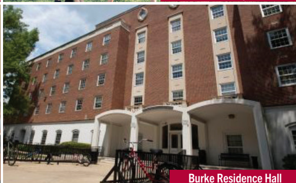
Burke Residence Hall