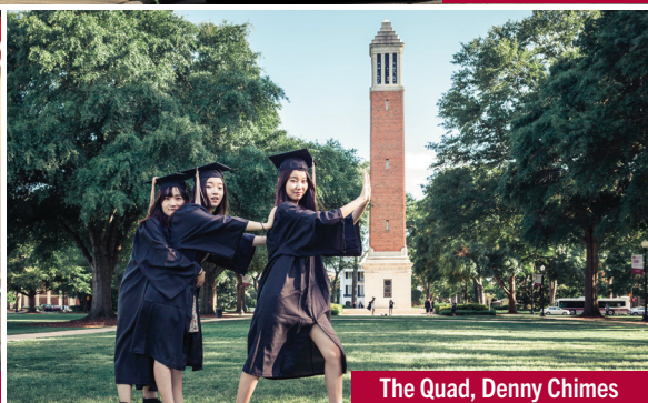
The Quad, Denny Chimes