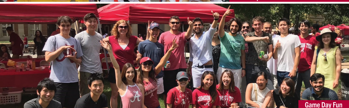
Game Day Fun