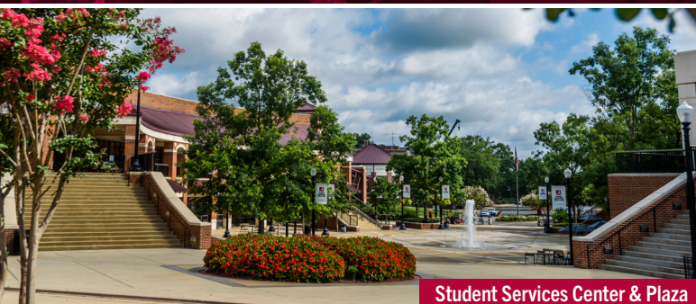
Student Services Center & Plaza