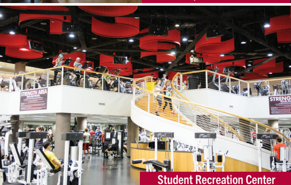
Student Recreation Center