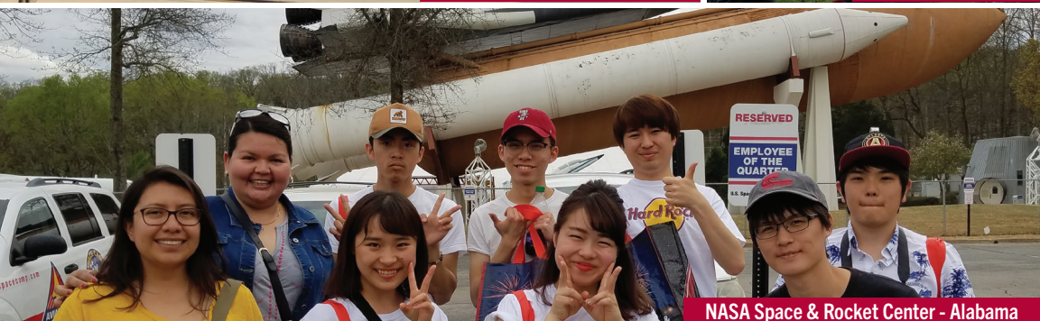
NASA Space & Rocket Center - Alabama