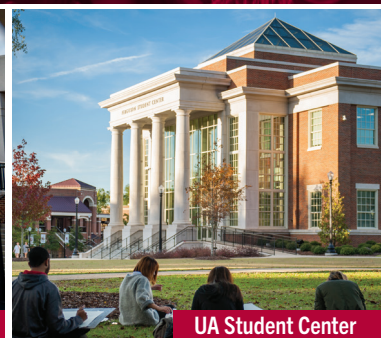
UA Student Center