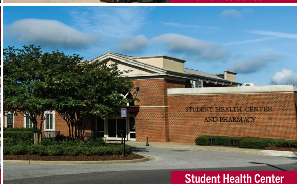
Student Health Center