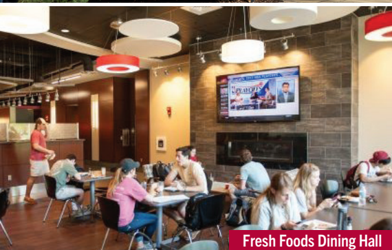
Fresh Foods Dining Hall