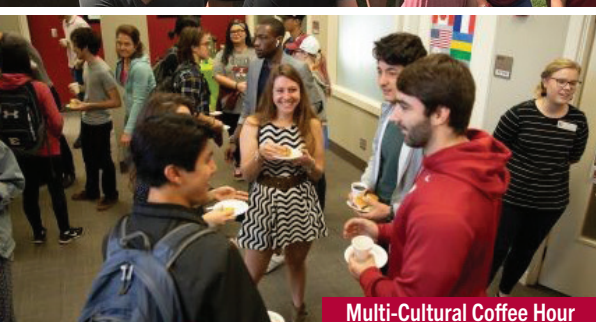
Multi-Cultural Coffee Hour