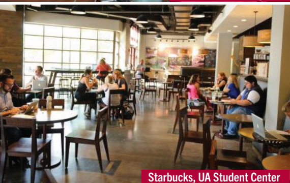
Starbucks, UA Student Center