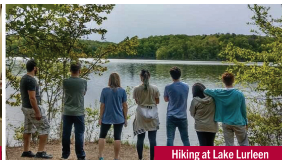
Hiking at Lake Lurleen