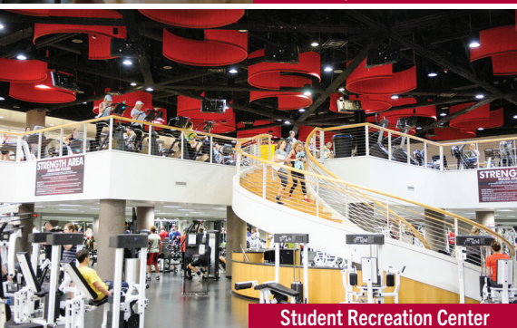
Student Recreation Center