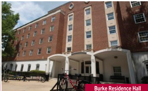
Burke Residence Hall