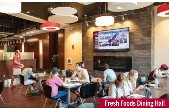
Fresh Foods Dining Hall