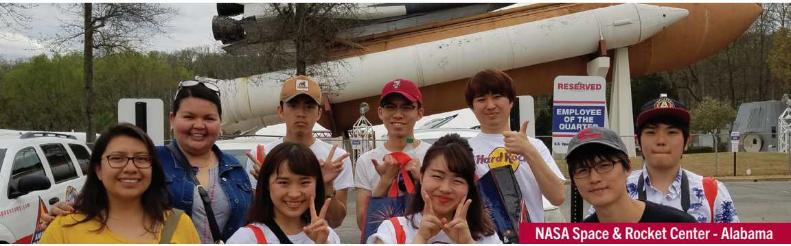
NASA Space & Rocket Center - Alabama