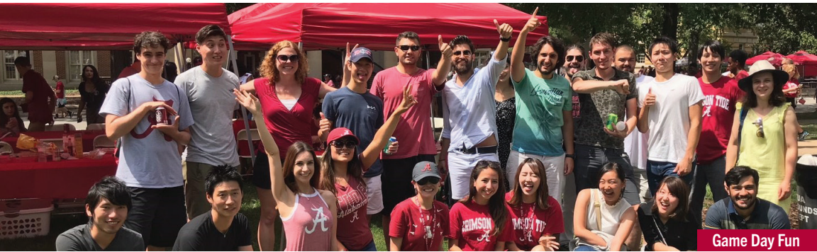
Game Day Fun