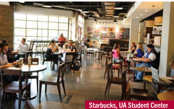
Starbucks, UA Student Center