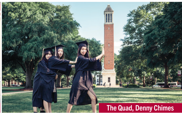
The Quad, Denny Chimes