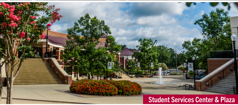
Student Services Center & Plaza