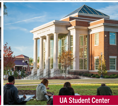
UA Student Center